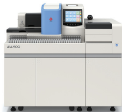
AIA-900 with 9 tray sorter 90 Tests Per Hour