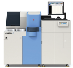
AIA-2000 200 Tests Per Hour