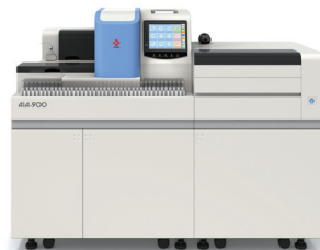
AIA-900 with 19 tray sorter 90 Tests Per Hour