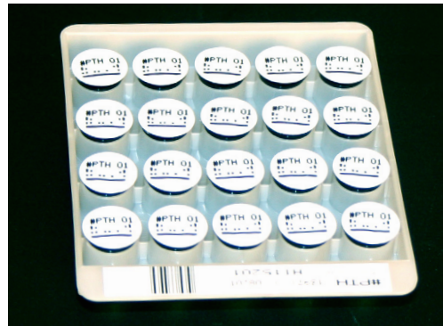
Tosoh AIA Intact PTH is packaged as 100 tests/kit, 5 x 20 cups/box.

Tosoh's Intact PTH results correlate well with the Allegro assay which was used in the National Kidney Foundation's Guidelines for treating dialysis patients.